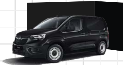
Onyx Black 1