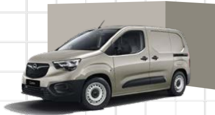
Cool Grey 3