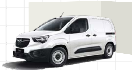
White Jade 1