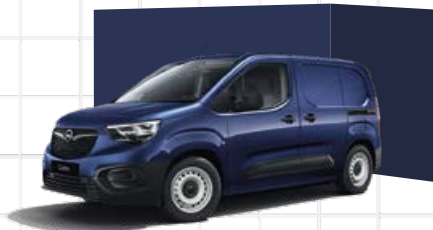
Night Blue 3