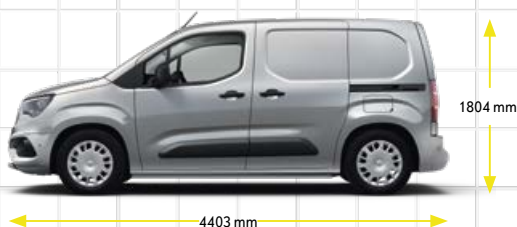
Combo Cargo L1