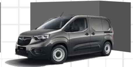
Moonstone Grey 3