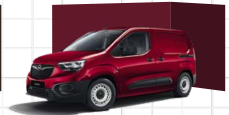
Ruby Red 2

1 Solid, 2 Brilliant, 3 Metallic, 4 Pearlescent.