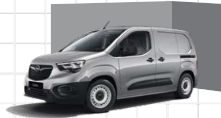
Quartz Grey 3