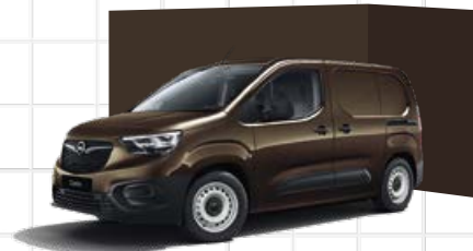
Cosmic Brown 4