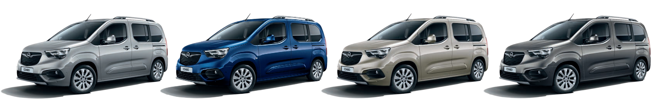
Quartz Grey Two coat metallic*