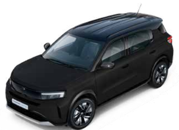
Carbon Black Metallic paint*

E&OE October 2025. Images shown for illustration purposes only. Please discuss colours available with your local Opel Dealer. *Metallic paint optional at extra cost. Standard paint at no optional extra cost. Due to the limitations of the printing process, the colours reproduced may vary slightly from the actual paint colour and trim material. As a result, they should be used as a guide only. Your Opel dealer has a comprehensive display of paint finishes.