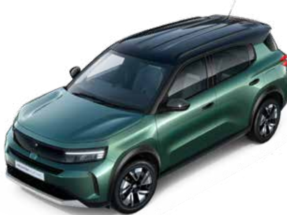
Khaki Green Metallic paint*