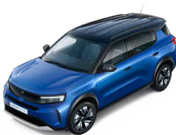
Effect Blue Metallic paint*