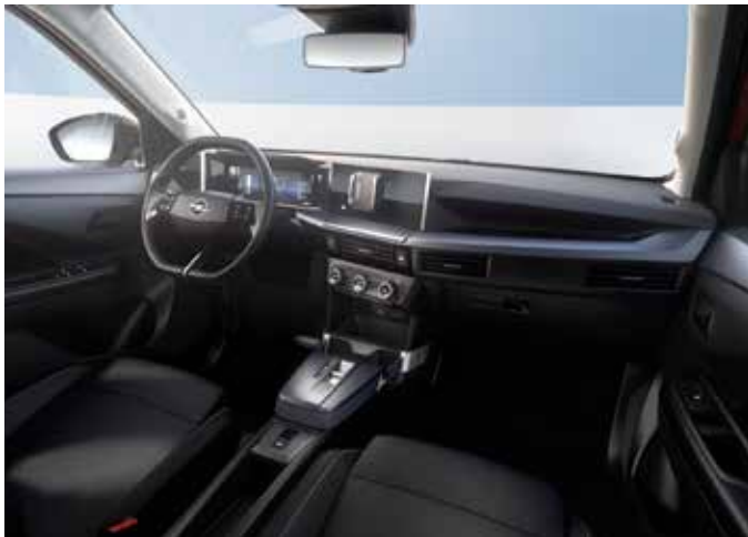
SC: Black fabric comfort seating