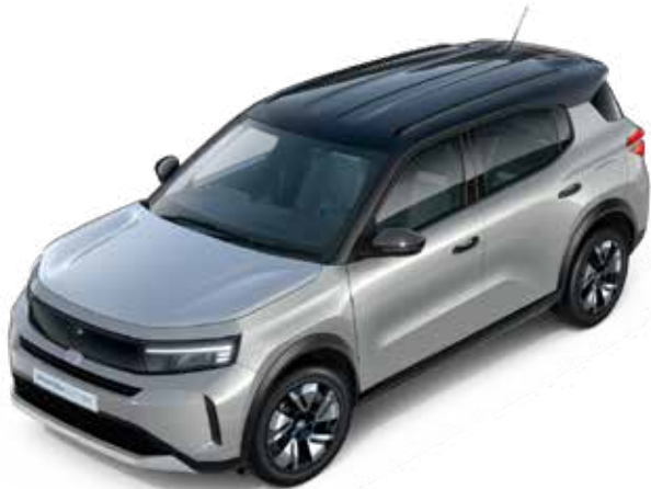
Crystal Silver* Metallic paint*