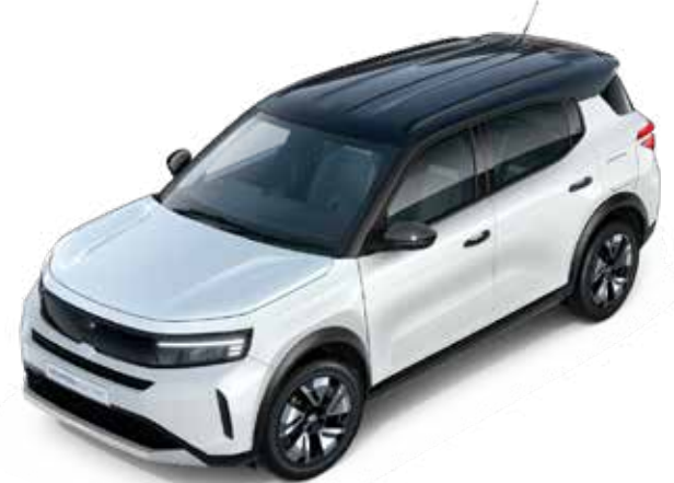
Arctic White Solid paint*