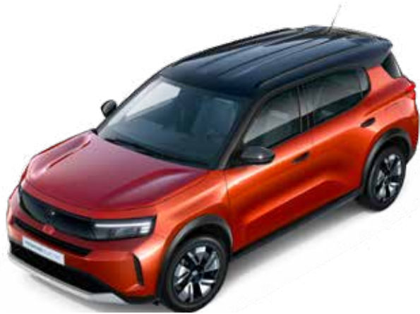
Kanyon Orange Metallic Paint*