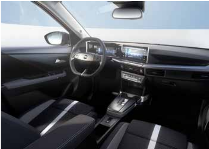
GS+ ELEGANCE: Intelli Seat Marl Grey Melange with Black fabric insert