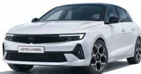
Jade White Metallic paint*