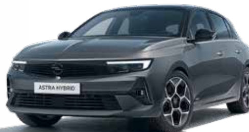
Artense Grey Metallic paint*