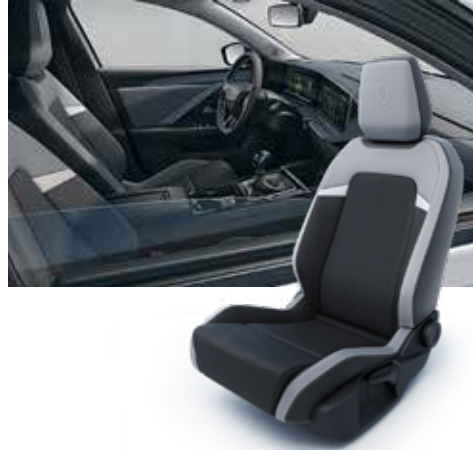
SC: Jet black Modene cloth seat trim.