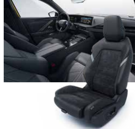
GS: Jet black Alcantara Suede leather effect trim.