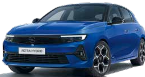
Vertigo Blue Premium paint*