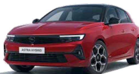
Hot Red Premium paint*

E&OE OCTOBER 2024. Images shown for illustration purposes only. Please discuss colours available with your local Opel Dealer. *Premium, Metallic and Brilliant paint optional at extra cost. Solid paint at no optional extra cost. Due to the limitations of the printing process, the colours reproduced may vary slightly from the actual paint colour and trim material. As a result, they should be used as a guide only. Your Opel dealer has a comprehensive display of paint finishes.