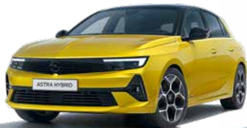
Yellow Amber Solid paint