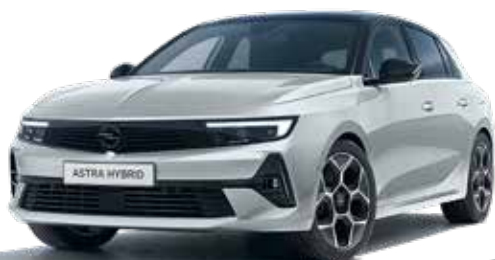
Crystal Silver Metallic paint*