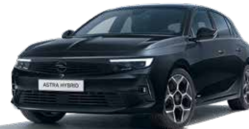
Perla Black Metallic paint*