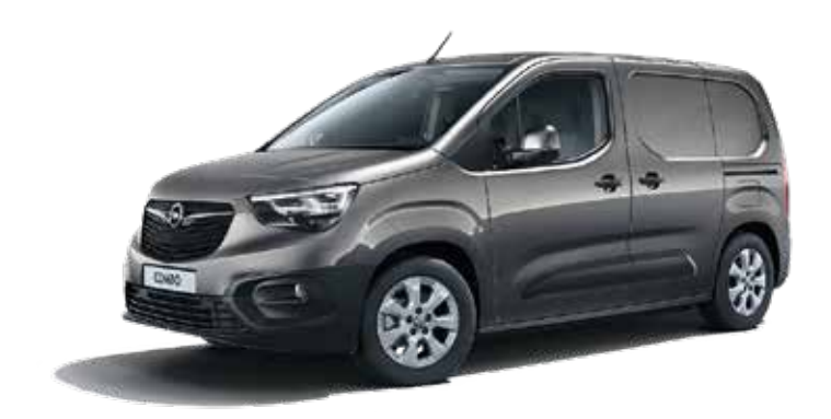
Moonstone Grey Two coat metallic*

E&OE May 2023. Images shown for illustration purposes only. Please discuss colours available with your local Opel Dealer. *Optional at extra cost. Standard paint at no optional extra cost. Due to the limitations of the printing process, the colours reproduced may vary slightly from the actual paint colour and trim material. As a result, they should be used as a guide only. Your Opel dealer has a comprehensive display of paint finishes.