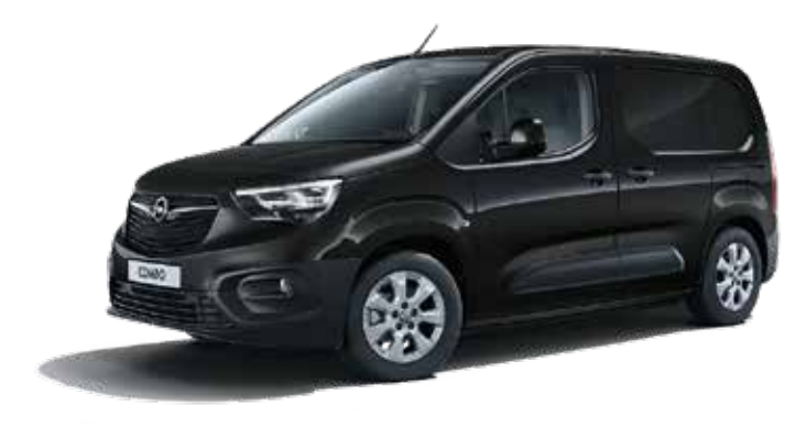
Black Two coat metallic*