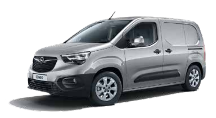
Quartz Grey Two coat metallic*