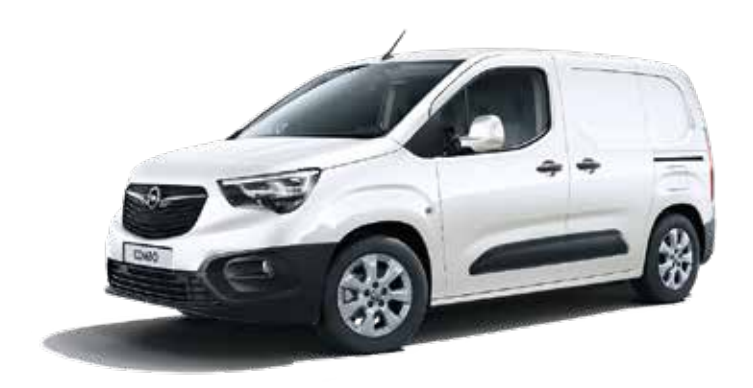
White Jade Solid