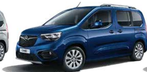
Night Blue Two coat metallic*