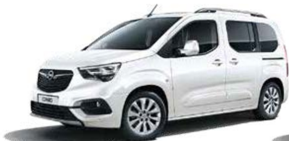
White Jade Solid