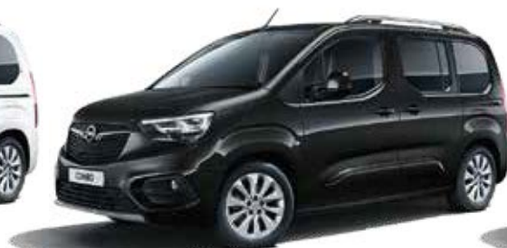
Black Two coat metallic*