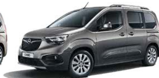
Moonstone Grey Two coat metallic*

E&OE July 2023. Images shown for illustration purposes only. Please discuss colours available with your local Opel Dealer. *Optional at extra cost. Standard paint at no optional extra cost. Due to the limitations of the printing process, the colours reproduced may vary slightly from the actual paint colour and trim material. As a result, they should be used as a guide only. Your Opel dealer has a comprehensive display of paint finishes.