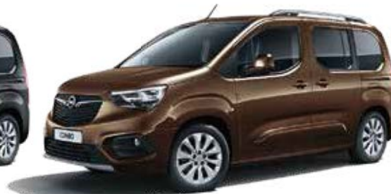
Copper Metallic Two coat metallic*