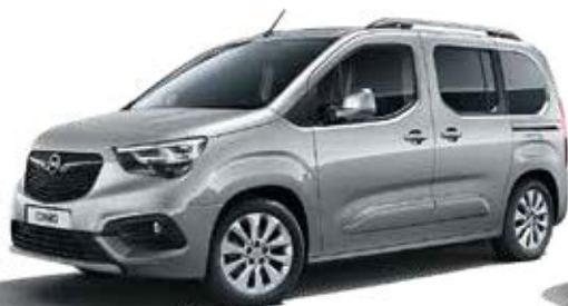
Quartz Grey Two coat metallic*