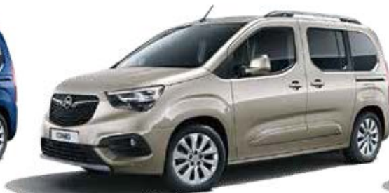
Cool Grey Two coat metallic*