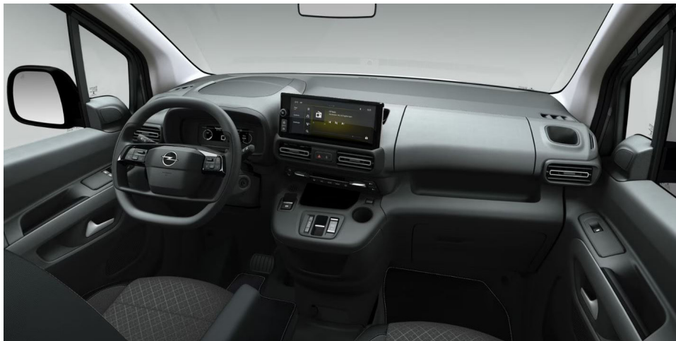
Brasilia China Grey Graphite & Brasilia Rajoles cloth seat trim