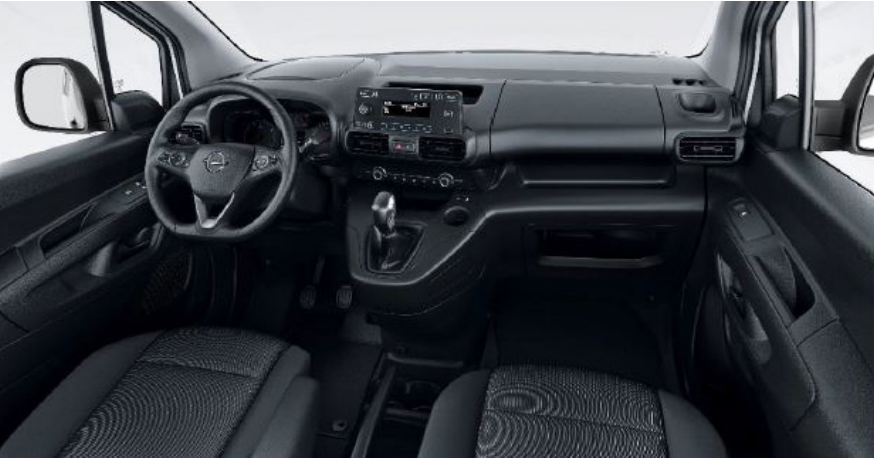
Mistral Gray Base cloth interior trim standard on Edition and Sportive models.