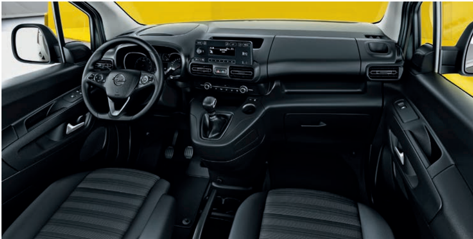
Mistral Gray Base cloth interior trim standard on Edition Plus models.