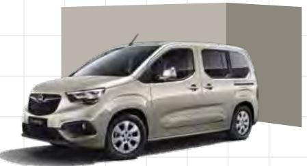
Cool Grey 3