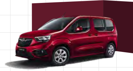
Ruby Red 2