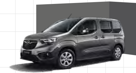
Moonstone Grey 3