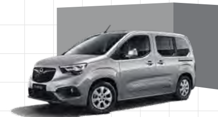
Quartz Grey 3