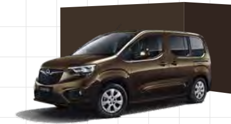
Cosmic Brown 4