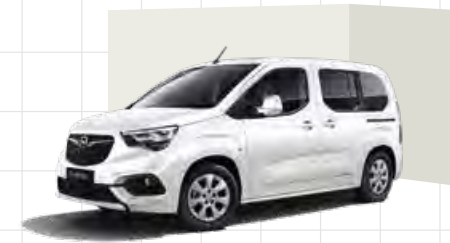
White Jade 1