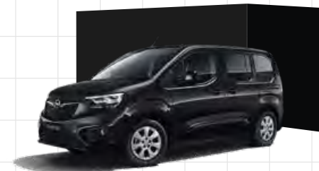
Onyx Black 1