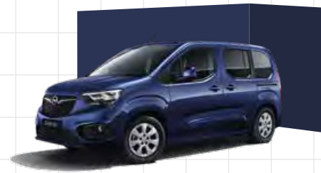
Night Blue 3

1 Solid, 2 Brilliant.* 3 Two-coat metallic.* 4 Two-coat pearlescent.*