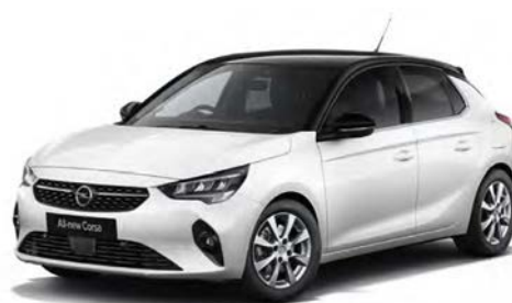
Summit White (GAZ)** Brilliant paint €155