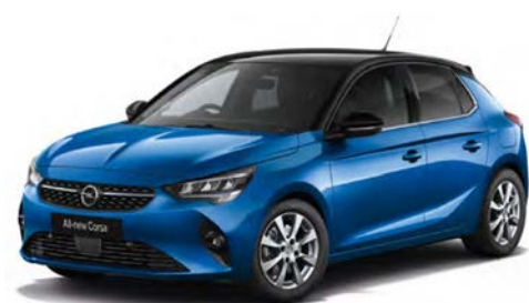
Voltaic Blue (G6L)** (Corsa-e only) Two-coat metallic paint €600