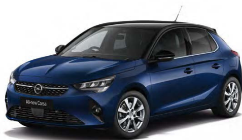
Navy Blue (G4B)* Two-coat metallic paint†