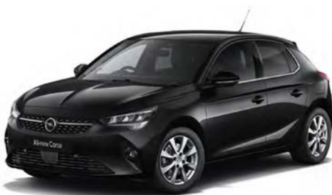
Diamond Black (G7o)** Two-coat metallic paint €600