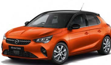
Power Orange (GPQ)** (Corsa-e only) Two-coat premium paint €750