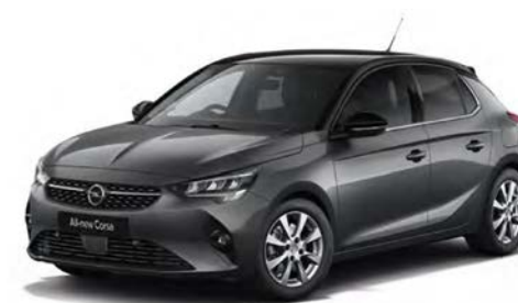
Moonstone Grey (G4o)** Two-coat metallic paint €600