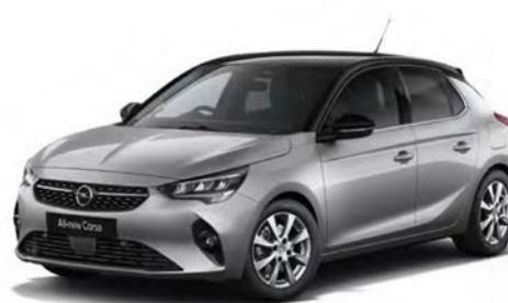
Quartz Grey (G4i)** Two-coat metallic paint €600