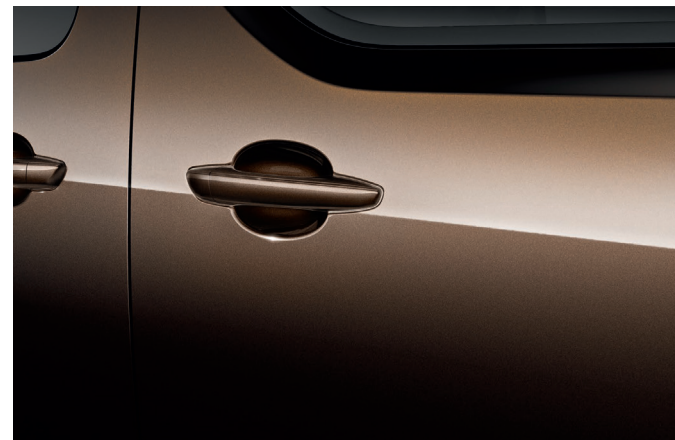
Rich Oak Brown