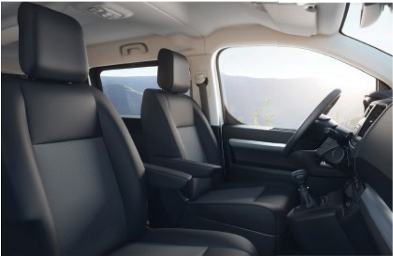
Tritone Grey fabric interior trim.