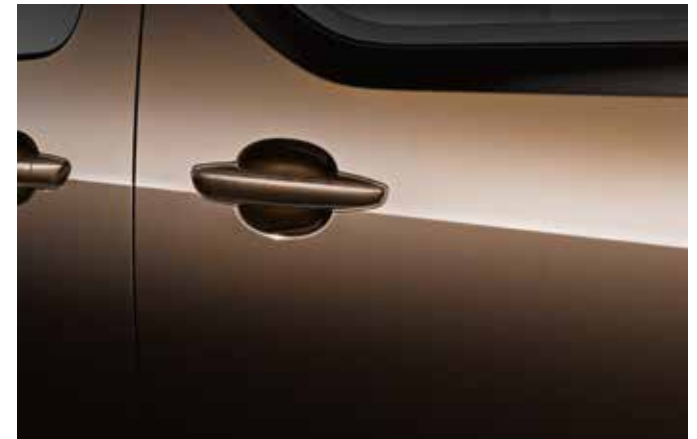
Rich Oak Brown