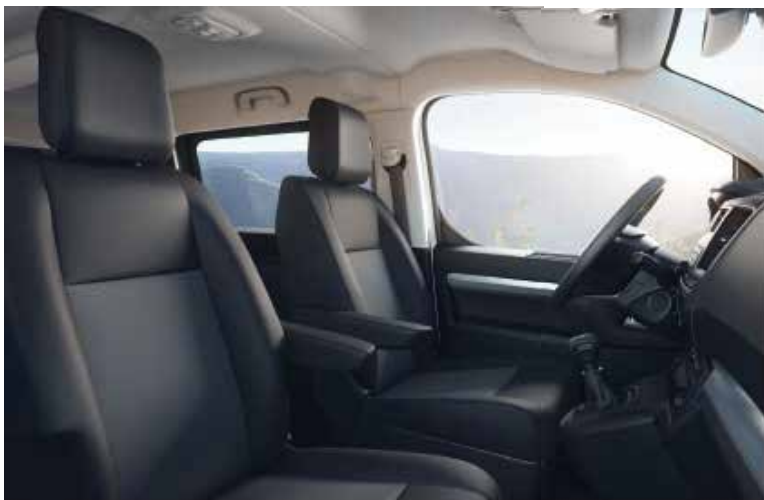
Tritone Grey fabric interior trim.