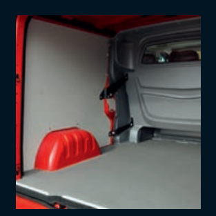
Load area finishing