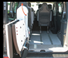
Swivel lift option available.