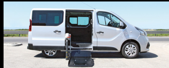
Fiorella Slim Fit installed on the side door.

Focaccia Group is certified ISO 9001:2008 and maintains constant contact to official European legislation via the Italian Ministry of Transport, ensuring the conversion is in line with EU regulations. For individual requirements and problems, a technical service is available from 8.00 to 12.30 and 14.00 to 17.30 CET via e-mail ( service@focaccia.net ) or phone +39 (0) 544 202344.