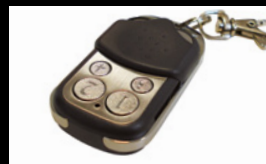
Wireless remote control included.

To find out more, visit [Opel conversion country website]