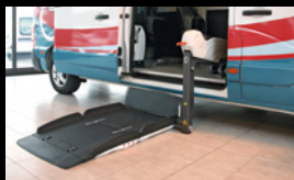
Fiorella lift on the side door.