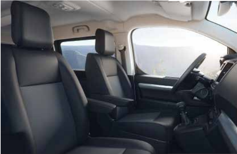
Tritone Grey fabric interior trim.